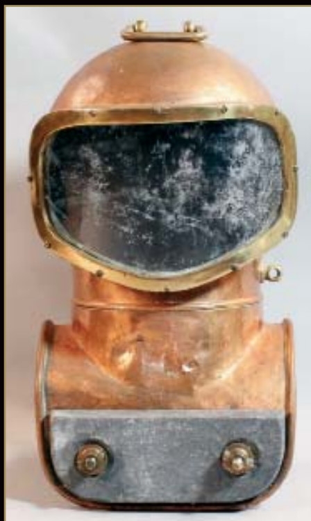
LOT 167 MORSE SHALLOW WATER DIVING HELMET

SUNDAY, APRIL 15, 2012 • 11 AM 185 PURCHASE ST. BOSTON, MA • WATERFRONT/FINANCIAL DISTRICTS 350 LOTS!