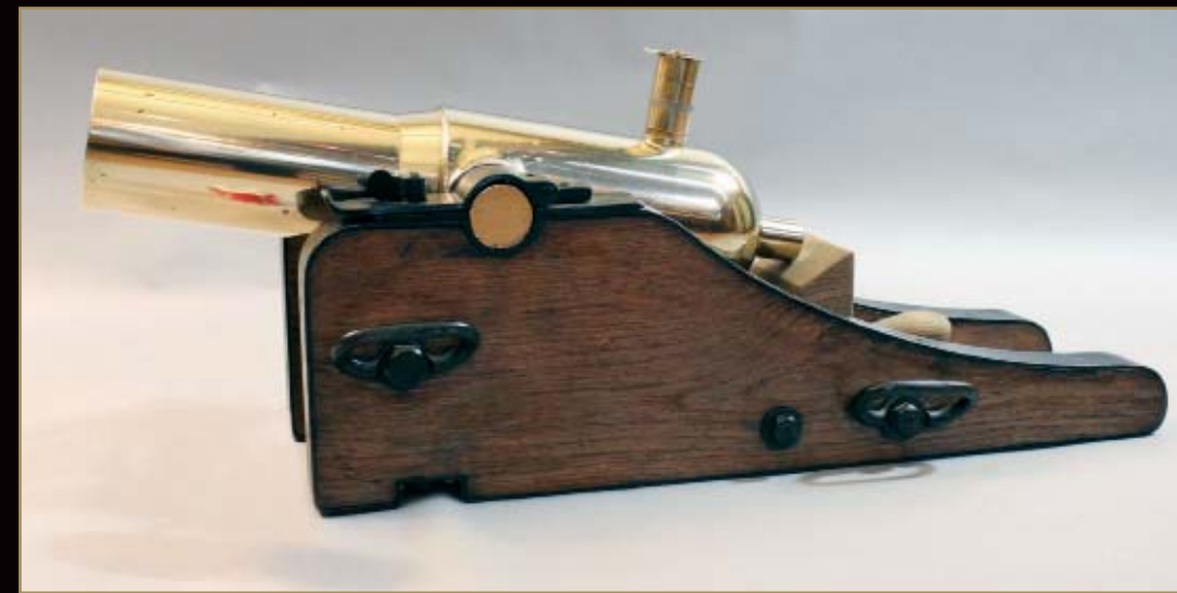
LOT 170 UNITED STATES LIFESAVING SERVICE CANNON, CIRCA 1905