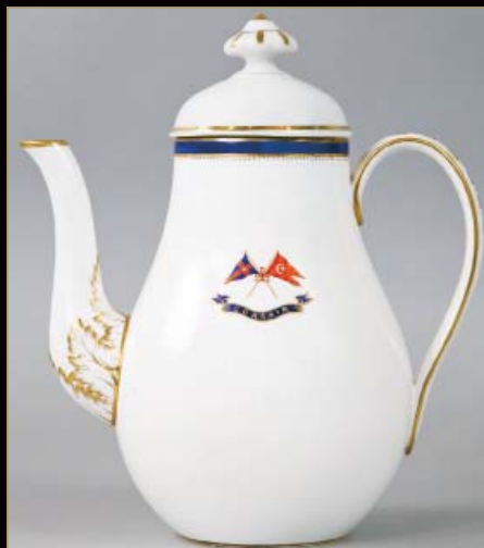
LOT 135 TEAPOT FROM J. PIERPONT MORGAN'S YACHT CORSAIR

SUNDAY APRIL 15, 2012 • 11 AM 185 PURCHASE ST., BOSTON, MA WATERFRONT/FINANCIAL DISTRICTS MASS LIC #2428