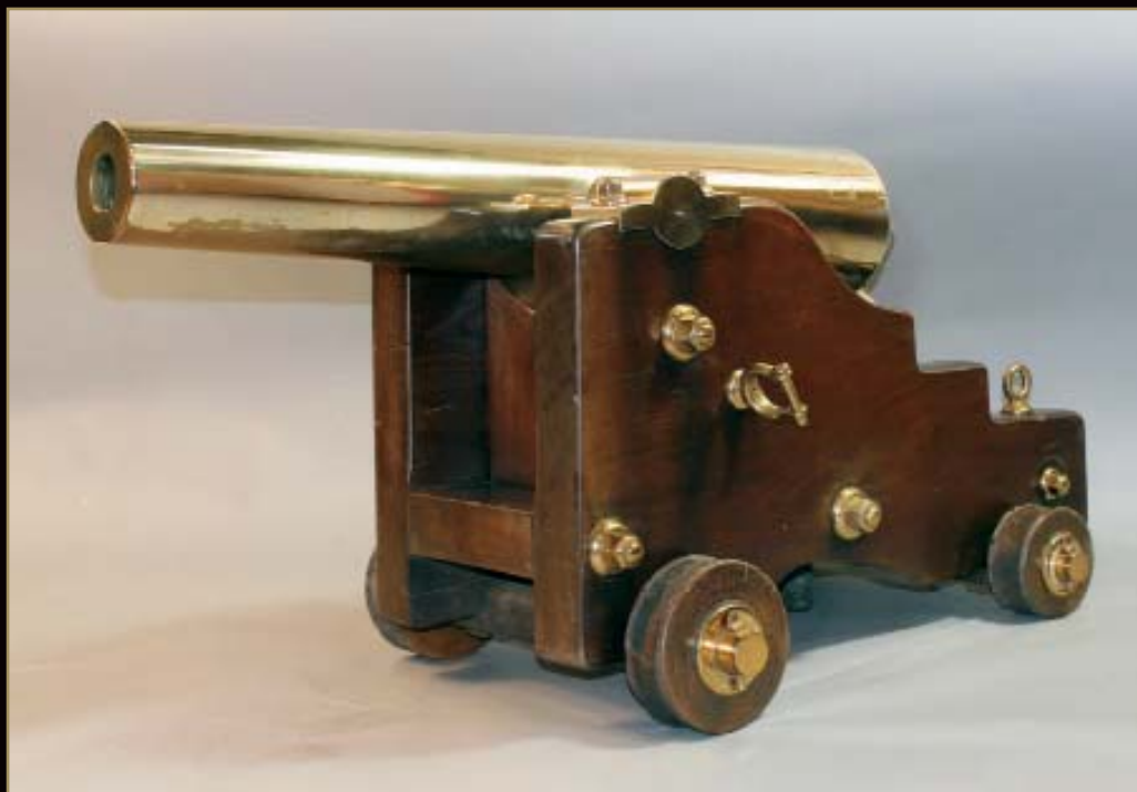
LOT 150 32 INCH YACHTING CANNON BY STRONG