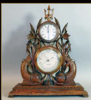
LOT 125 19TH CENTURY CLOCK & BAROMETER SET BY SALOM OF LONDON

SPRING MARITIME SALE SUNDAY APRIL 15, 2012 • 11 AM 185 PURCHASE ST., BOSTON, MA