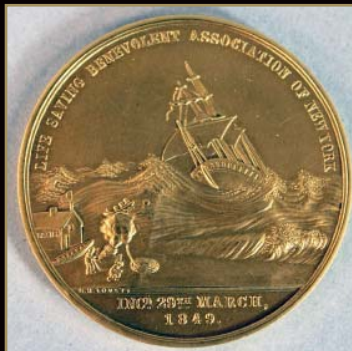
LOT 130 SOLID GOLD LIFESAVING MEDAL BY TIFFANY, 1926