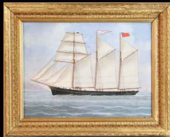
LOT 176 19TH CENTURY, ITALIAN PORT PAINTING BY M. LLOYD MORRIS

PHONE: 617.451.2650 OR 617.549.2881 • FAX 617.451.6468 WWW.BOSTONHARBORAUCTIONS.COM • INFO@BOSTONHARBORAUCTIONS.COM