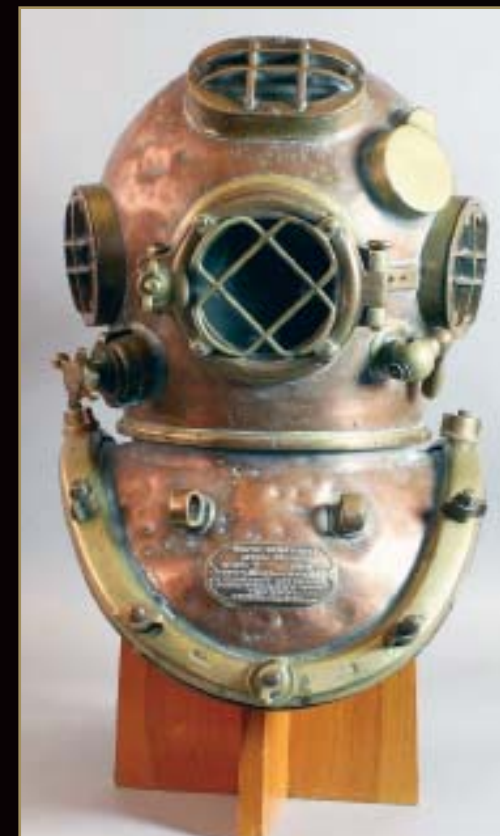
LOT 180 SCHRADER, MARK V, DIVING HELMET

PREVIEW TIMES: FRIDAY, APRIL 13, NOON – 6PM SATURDAY, APRIL 14, 10 AM – 6PM SUNDAY, APRIL 15, 8:30 AM – 10:30 AM